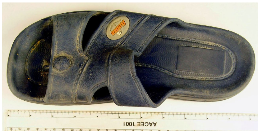
Figure 1: Footwear of the accused (front side)

Adobe Photoshop or simply Photoshop [1] , is a graphics editing photography software program developed by Adobe Systems for Mac OS X and Microsoft Windows, designed to assist professional photographers in managing thousands of digital images and doing post production work. It is an image management application database which helps in viewing, editing, and managing digital photos. The blood soaked foot wear imprint ( figure-4 ) is marked as EX-1 and the reverse side foot wear of the accused ( figure-2 ) is marked as EX-2 and here on will be referred as EX-1 and EX-2.