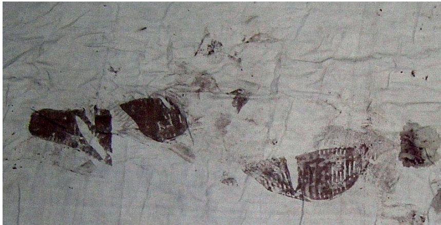
Figure 3: Blood soaked footwear imprint on the bed sheet at the scene of crime