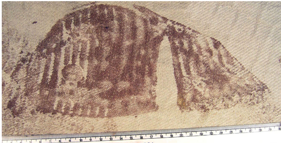
Figure 4: The blood soaked footwear imprint of the right foot