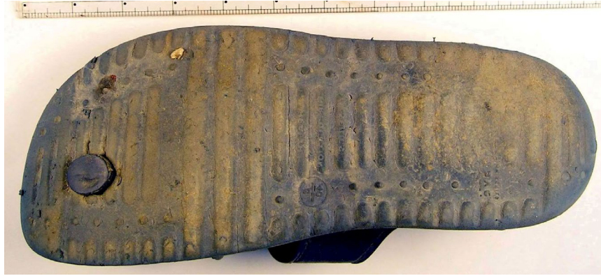
Figure 2 : Footwear of the accused (reverse side)