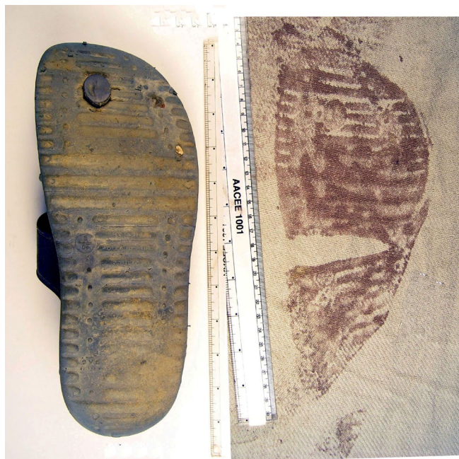
Figure 5: Horizontal stripes and dots in EX-1 & 2