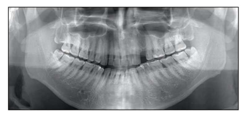
Fig 3: Panoramic radiograph showing Bilateral Distomolars in lower arch: