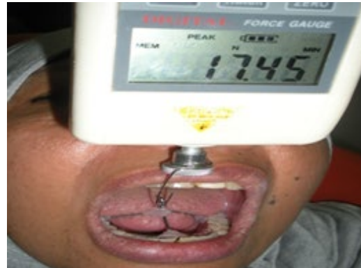
Figure:6,7 Measurements of RPD retention