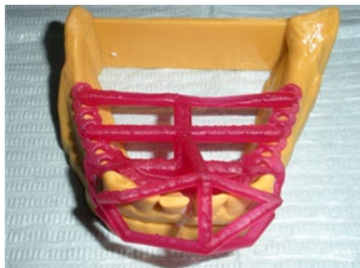
Figure:4 The 3D printed framework pattern on the 3D printed polyamide model