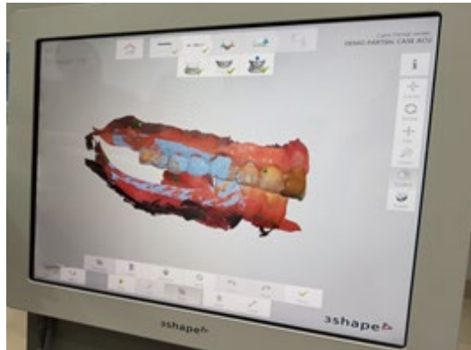
Figure:1 Digital impression