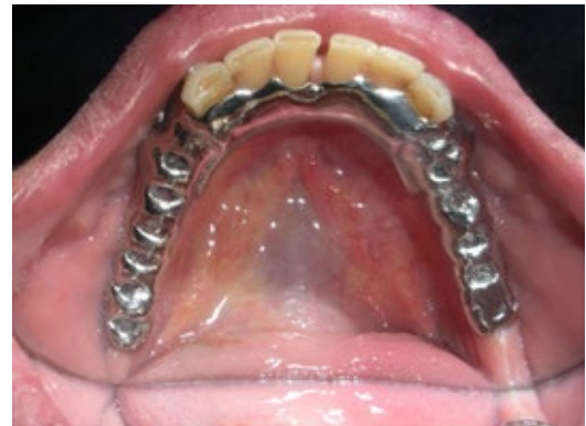
Figure:5 Try in of the metal framework