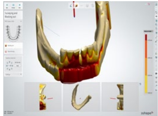
Figure:2 Digital surveying and block out