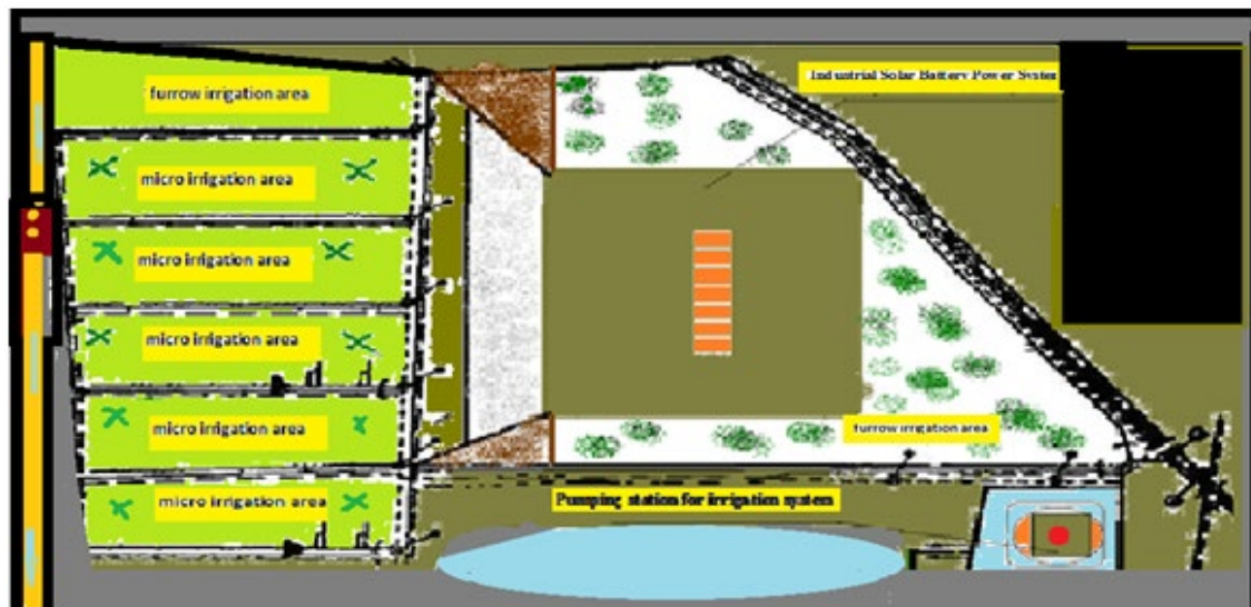
Fig.2: Scheme of the irrigation sprinkling station on the experimental part of the Terter RACS in the Garabagh land in the period 2006-2010 with the use of the Idad and MDR sprinklers: