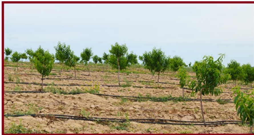
Fig.3: Demonstration of the micro-irrigation regime using drip irrigation of fruit trees in the conditions of the EIA of the Research Institute of Erosion and Irrigation in the Shamakhi district in the village of Malkham.

The discharge was 20-30%, which led to uneven moistening. At the beginning of vegetation due to timely treatments, the surface discharge decreased (up to 8-10%). When the treatment of crops ceased, the discharge again reached 16-17%. Soaking of the soil during watering did not exceed 30-60 cm. Greater wetting and better uniform moisture distribution under these conditions is achieved with irrigation rates of more than 300-400 m 3 / ha. At such rates about 60-70% of water