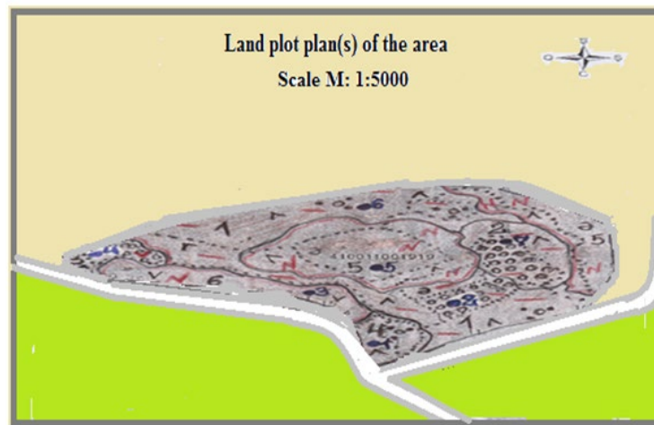
Fig.1: Land plot plan (s) of the area the village Malham of the Shamakhi

The climatic and climatic conditions of the Aral rocks are favorable for the cultivation of algae. Lacquer and high-quality products are also available due to climate change and agricultural technology, taking into account the climatic conditions and biological characteristics of the plant. During their studies, they studied and studied the peculiarities of the local agrarian nature, the land plot, the armagic boy and the development of dynamics, macro-and microelement droppers applied using micro-irrigation technologies, drip irrigation, predominantly traditional irrigation dominant technology that allows the issuance of mineral fertilizers along with irrigation water for local nutrition of plants. As a result of the research, the most effective yields and indicators of macro and microclimate used in sewage treatment plants. Macro and Macro elements together with irrigation water are provided as follows.