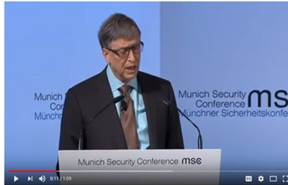
BREAKING Bill Gates warns of devastation to world leaders on Bio terrorism February 18 2017

These data suggest that the during February 16-18, 2017, in the 54th Security Conference Munich Security Conference (MSC) was held in Germany, during this MSC Mr. Bill Gates clearly mentation that 30 million of people will be affected by epidemic pathogen. This evidence can be view in the given link https://www.youtube.com/watch?v=azqL6MRPzfk [14]