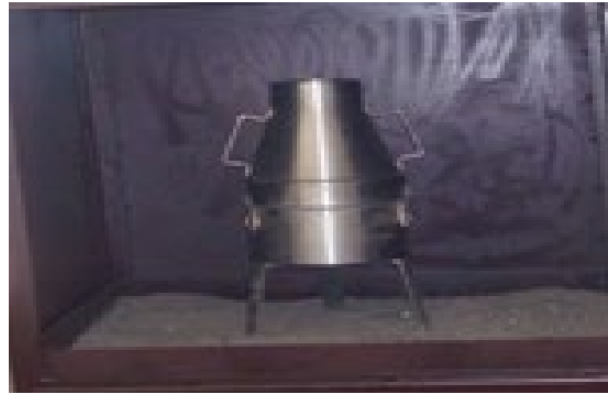
Fig 1: Laboratory SHS installation

sand, recesses were made, where a sample of the charge consisting of the initial mixtures of the stoichiometric composition was placed. The pre-mixed charge was placed in a pit of quartz sand and closed with a conical cover. In the center of the sample the initiator (Ti+C) was filled. Combustion was carried out by means of a tungsten spiral heated by electric current from the upper end of the sample. Under these conditions, a chemical reaction is excited in the surface layers of the mixture and a combustion wave is formed, propagating at a constant speed along the entire length of the sample, i.e., there occurs a SHS. The combustion proceeds during 10...15 sec. within the temperature range of 2300...2500°C. When cooling the combustion products, a porous mass is formed as a result of whose grinding the powder is obtained.